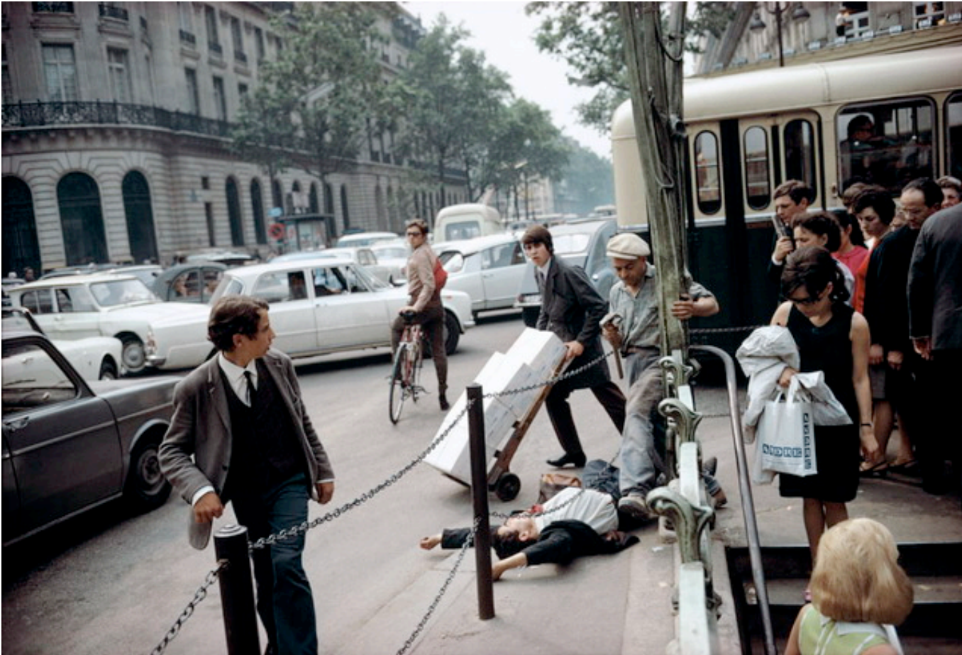
Fallen Man, Paris, France 1967