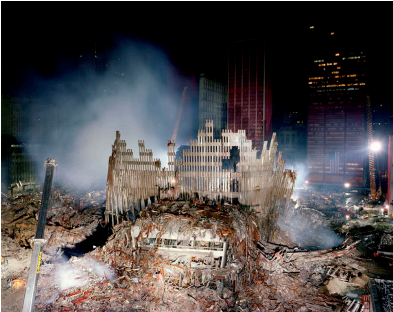
The Twin Towers 2001 Joel Meyerowitz